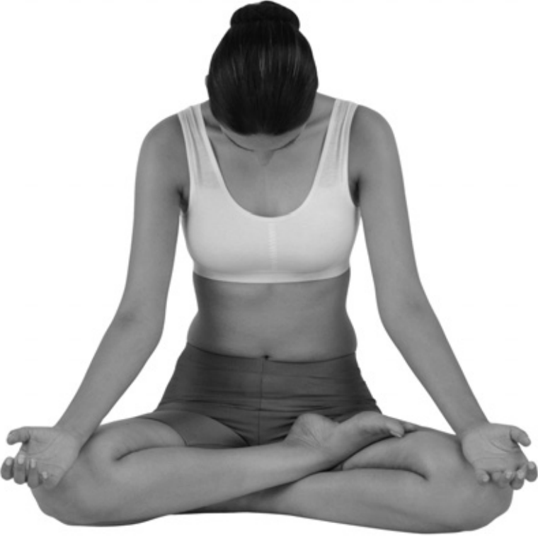
महाबन्ध – Mahabandha